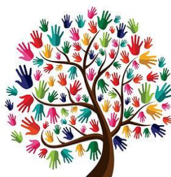
Norfolk Special Education Parents Advisory Council

Happy first days of fall! In a Minute or Less....The goal of this issue is to provide an overview of Norfolk's SEPAC: Special Education Parent Advisory Council. Click here to visit their website.